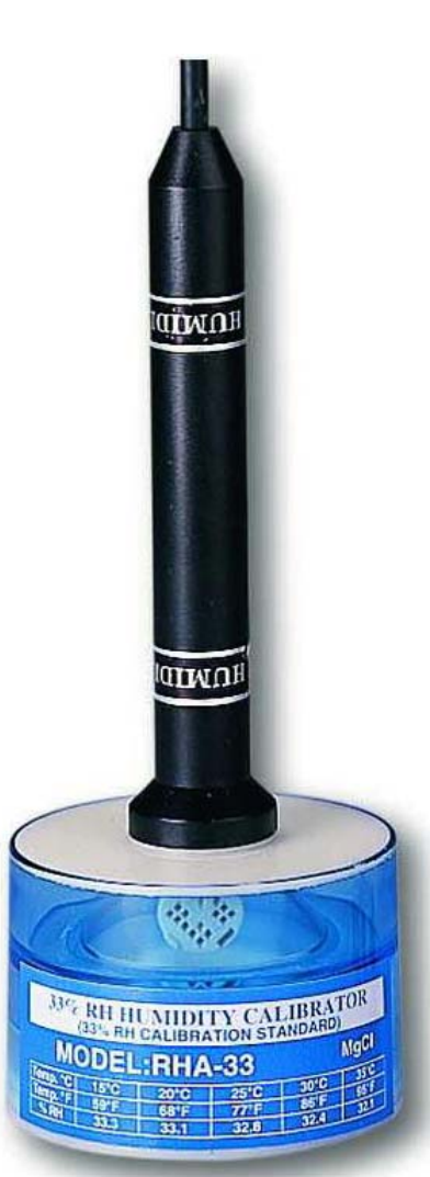
33 %RH HUMIDITY CALIBRATOR