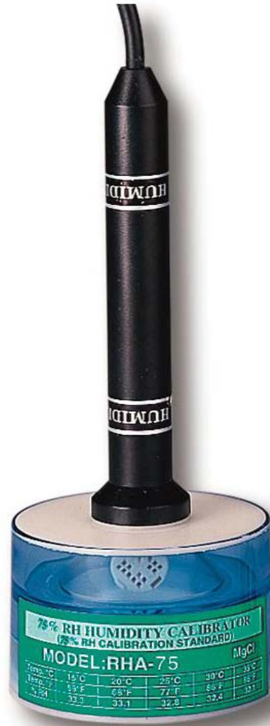
75 %RH HUMIDITY CALIBRATOR