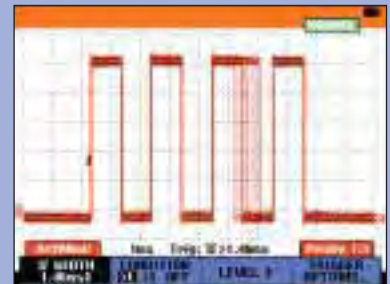
Pulse width fluctuations are clearly visible using Digital Persistence

The new Digital Persistence mode helps to find anomalies and to analyze complex dynamic signals by showing the waveforms amplitude distribution over time using multiple intensity levels and user selectable decay time – it's as if you're looking at the display of an analog, real time oscilloscope! A fast display update rate reveals signal changes instantaneously, useful for instance when making adjustments to a system under test.