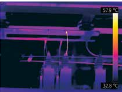
Hot power line transformer