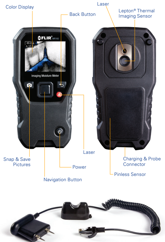
MR02 Pin Probe included

Equipment described herein may require US Government authorization for export purposes. Diversion contrary to US law is prohibited. Imagery for illustration purposes only. Specifications are subject to change without notice. ©2015 FLIR Systems, Inc. All rights reserved. (Updated 06/15/15)