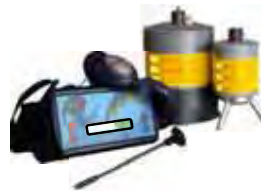
Optional : GMA105

Surge Generators SG 200032, SG 130032, SG 50016, SG 7505 Cable Identification System CI75, CI200 Burndown Unit BU 3500 Ground Microphone Amplifier GMA105 Cable Reel System CRS30 DC Pressure Testers 2010PT AC Pressure Testers 3010PT Combination Pressure Testers (AC+DC) 5010PT, 7010PT, 10010PT, 3042PT VLF Pressure Testers VLF20 Fault Pre-Locators PCA101+AE101 Test Vans & Trailers Sheath Fault Locators SFL16