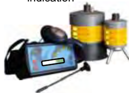
Optional : GMA105

Surge Generators SG 200032, SG 130032, SG 50016, SG 7505 Cable Identification System CI75, CI200 Burndown Unit BU 3500 Ground Microphone Amplifier GMA105 Cable Reel System CRS30 DC Pressure Testers 2010PT AC Pressure Testers 3010PT Combination Pressure Testers (AC+DC) 5010PT, 7010PT, 10010PT, 3042PT VLF Pressure Testers VLF20 Fault Pre-Locators PCA101+AE101 Test Vans & Trailers Sheath Fault Locators SFL16