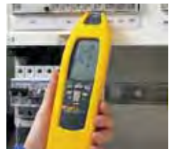
Location of fuses/breakers and assignment to circuits