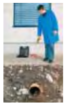
Tracing of underground cables (max. depth 2.5 m)