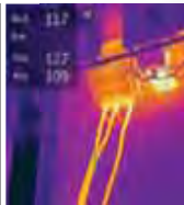
Delta T-Differential Temperature