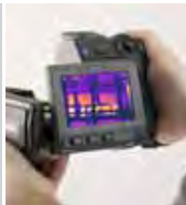
Multifunction 3.5" Touch-Screen