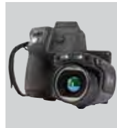
5 MP Digital Camera with Lamp