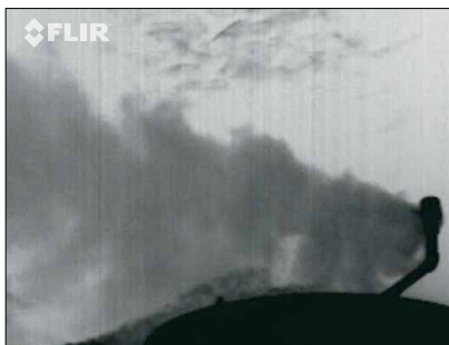
Venting pressure relief valve on storage tank