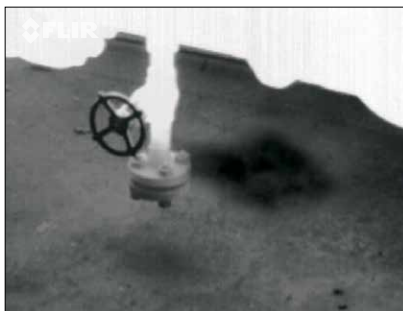
Methane leak at natural gas production site